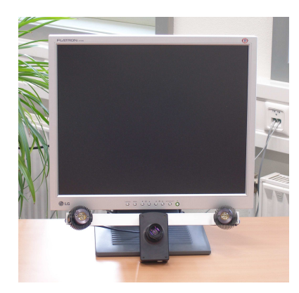
Fig. 1. Physical setup of the eye tracking hardware, consisting of a single high-resolution camera below the display and two infrared LEDs to either side of the camera.

on simulated data show the gaze estimation algorithm can achieve an accuracy of one degree or better.