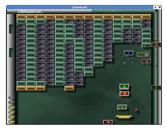
Figure 1. Screenshot of LBreakout2.