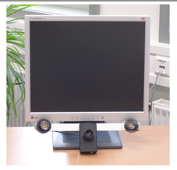
Figure 1. Remote eye tracker system setup. The eye tracking hardware consists of a single high-resolution camera below the display and two infrared LEDs to either side.

The 2nd Conference on Communication by Gaze Interaction - COGAIN 2006: Gazing into the Future